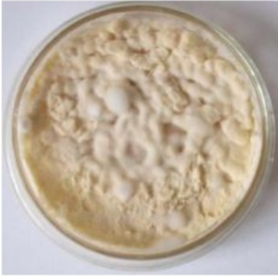
Figure 2 Fungi Beauveria bassiana from death larvae on PDA media

gathered at the end of colony. Conidium was single-celled, oval and round.